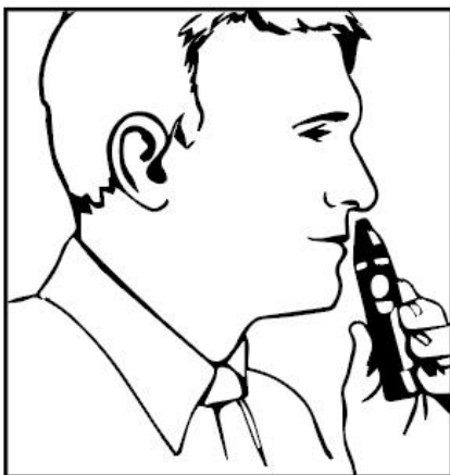
TRIMMING NOSE HAIR

CAUTION: Do not apply excessive pressure. Doing so may damage the trimmer attachment or result in skin injury.