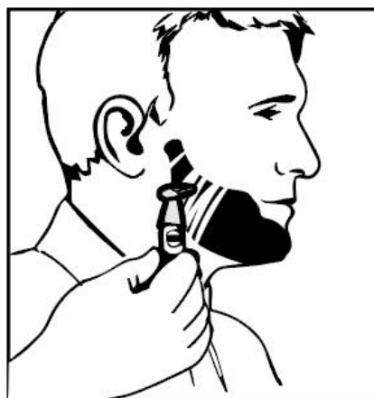
TRIMMING A BEARD